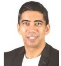
Co-Founder Serv LCC