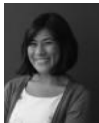
City Adviser C40 Cities